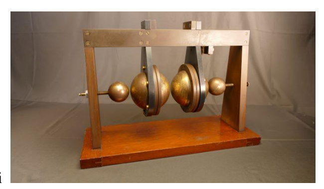
4 spark balls assembly type Augusto Righi