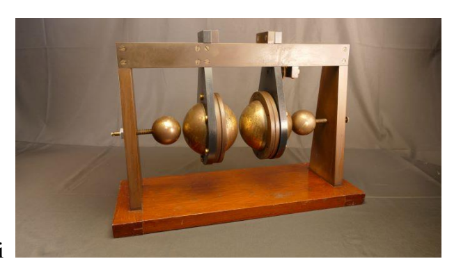
4 spark balls assembly type Augusto Righi